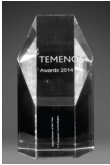
Temenos Sales Award 2014

Anabatic has achieved numerous Awards through its career. We have received awards from our key partners such as IBM, Temenos, Microsoft and others. Among the notables awards we have received throughout the years are :