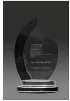
SAP Best Mobility Deal 2014