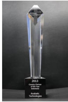
Microsoft Country Partner of the Year 2013