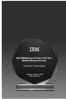
IBM Business Partner of the Year Mobility 2014