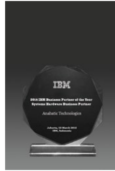
IBM Business Partner of the Year Systems Hardware 2014